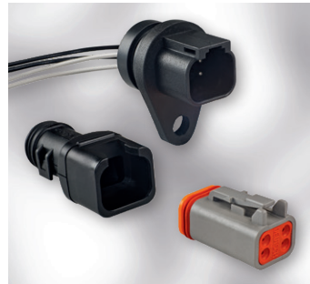
4 Position DEUTSCH Connector DT Series