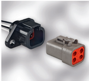
4 Position DEUTSCH Connector DTP Series