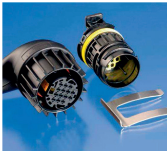
Up to 16 Position Connector