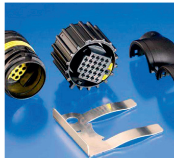
Up to 24 Position Connector