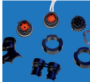
Up to 6 Position Connector