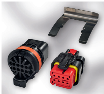
Up to 8 Positions Connector