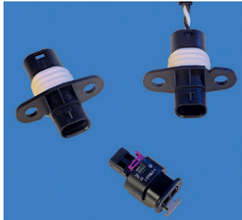
2 Position Connector

TE Industrial & Commercial Transportation's heavy-duty electrical connectors are designed to withstand dirt, oil, and extreme vibration. These rugged, environmentally sealed connectors meet the specific needs of cylinder head wiring applications.